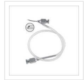
I And A - Simcoe Ophthalmic Cannula