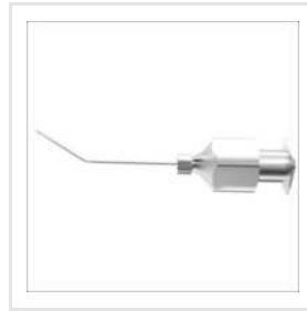
Feaster Nucleous Hydro Delineator