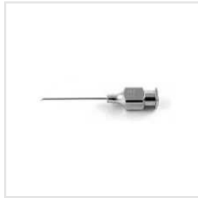
Steel Cystotomes Ophthalmic Cannula