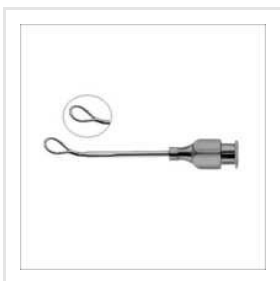
Anis Irrigating Vactus Lens Removal