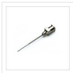
Lacrimal Reinforced Ophthalmic Cannula