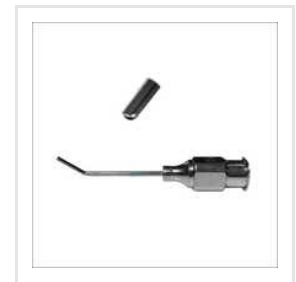
Bishop Harmon Air Injection Ophthalmic