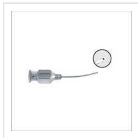
Subtenon's Anesthesia Ophthalmic Cannula