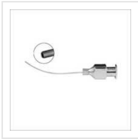
Stainless Steel West Lacrimal Ophthalmic