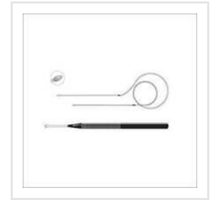
Stainless Steel And Silicon Lacrimal