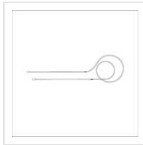
Dacryocystorhinostomy (DCR) Set Ophthalmic