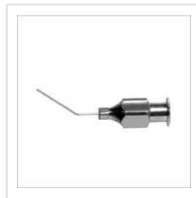
Mcintyre Anterior Chamber Air Injection