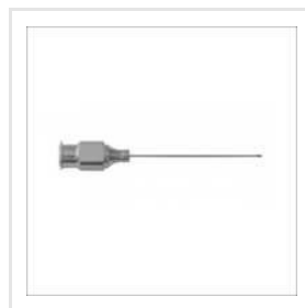
Sharppoint Retro Bulbar Anesthesia