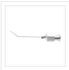
SS Healon Cortex Aspiration Ophthalmic