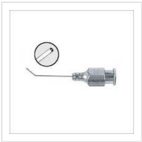
Visco Flow Air Injection Ophthalmic Cannula