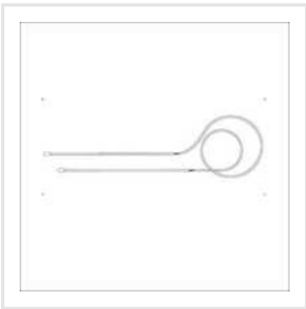
SS Lacrimal Intubation Set Ophthalmic