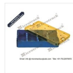
STERILIZATION TRAYS FOR PHACO PROBE